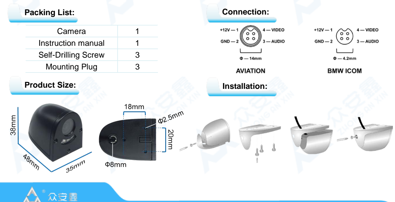
> Specifications are subject to change without prior notice